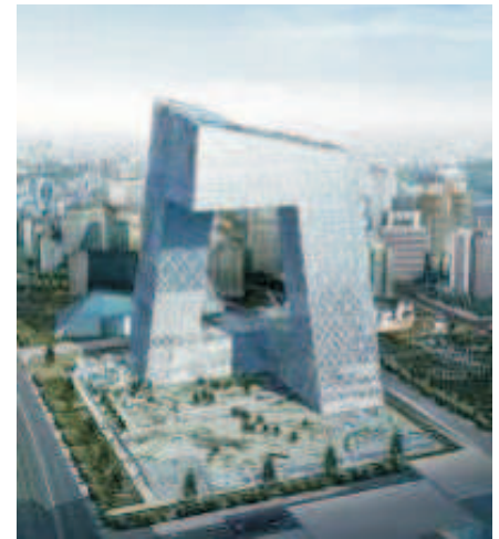
The new Chinese Central TV Building in Beijing was completed in 2008.

The Chinese have a saying, "If the old doesn't go, then the new cannot come," and certainly Beijing has been transformed by the scores of new buildings built in preparations for the Olympics. One of the most surprising features of these ultra-modern buildings and structures is the Chinese use of foreign architects and the departure from traditional Chinese architectural forms. Many of us saw some of these structures during the television coverage of the Beijing Olympics. The National Stadium, dubbed the Bird's Nest, was designed by a Swiss firm, and the Beijing National Aquatics Center, dubbed The Water Cube, was designed by an Australian firm. But Beijing also has been building many other buildings to modernize the city. Buildings like the National Center for the Performing Arts, dubbed The Egg, is a titanium and glass building that appears to float on the lake that surrounds it, was designed by a French architect, and the new CCTV building, which is now the second largest building in the world next to The Pentagon in terms of useable floor space, was designed by a Dutch architect and has an interesting and unusual 'loop' feature in its design.